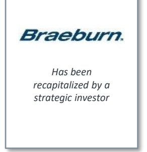
*Braeburn Systems Designs and manufactures thermostats and accessories